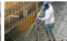
7 to 12 bar: Shotcrete applications