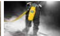
7 bar: Handheld tools