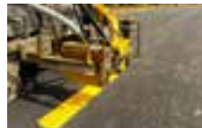
5 bar: Road line painting