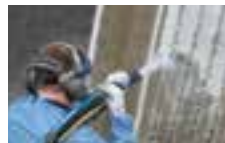
8.6 to 10 bar: Abrasive blasting